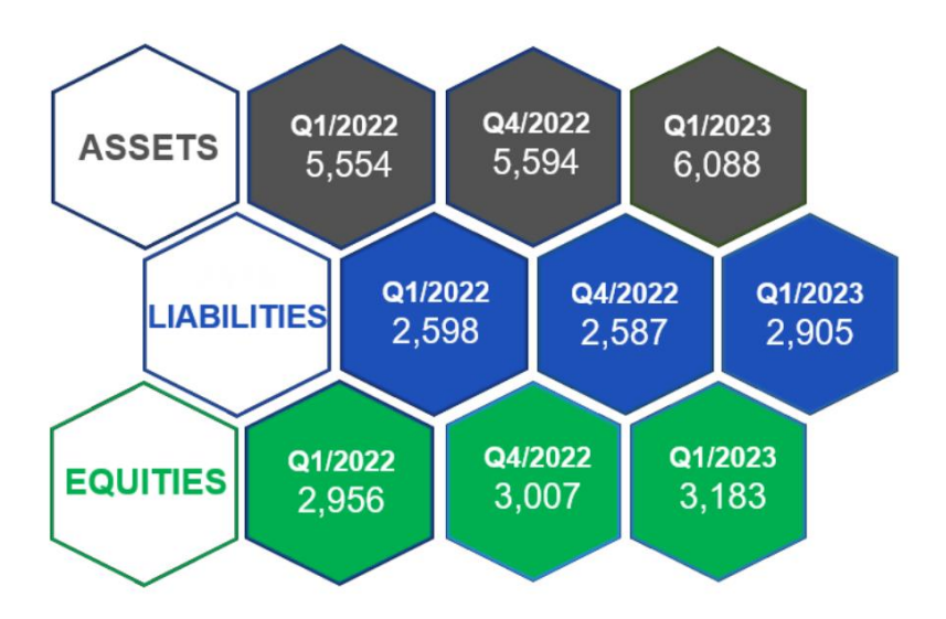
Figure 3: Comparison of Statements of Financial Position (Quarterly)

The reasons for the change from the consolidated statement of financial position are as follows.